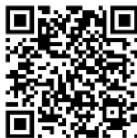
ORF-SIG Facebook group bit.ly/orfsig-fbgroup

Take advantage of our member-only communication forums to share and develop ideas.