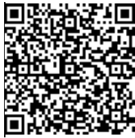
Residency & Fellowship Qualified Applicants http://bit.ly/3u0JR0s nityhub