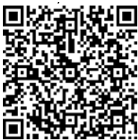
Residency & Fellowship Interest http://bit.ly/2OH6zdX