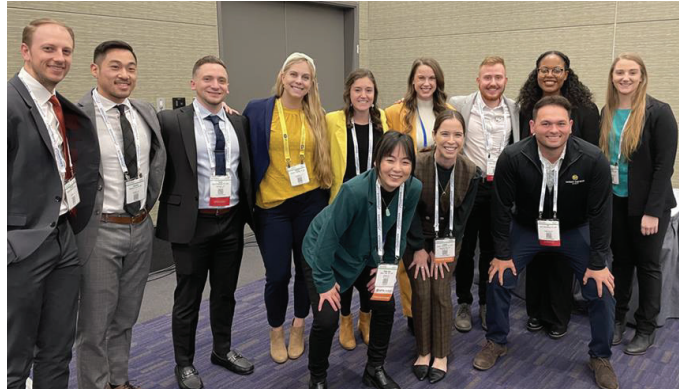
12 Orthopaedic Residents presented from across the country